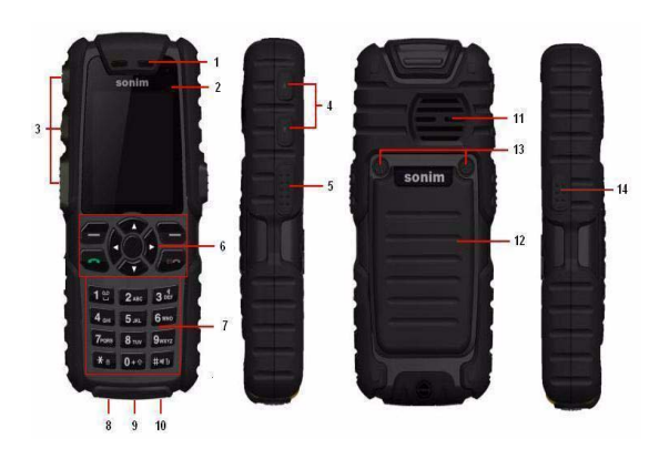
XP3 at a glance

The XP3 keypad has seven function keys and 12 alphanumeric keys. The left side of the phone has three keys and the right side of the phone has one key.